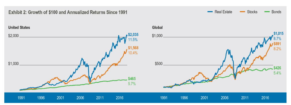
At September 30, 2018.

11.5% per year, compared with 10.4% for the S&P 500 and 5.7% for U.S. bonds (Exhibit 2). Compounded over the years, REITs provide a 30% performance advantage over the broad stock market. The story is similar for global indexes, with REITs and other real estate securities outperforming stocks and bonds over the same time period. Whether focused on the U.S. or global markets, real estate has consistently been among the better performing asset classes, demonstrating the potential of real estate to enhance long-term returns.